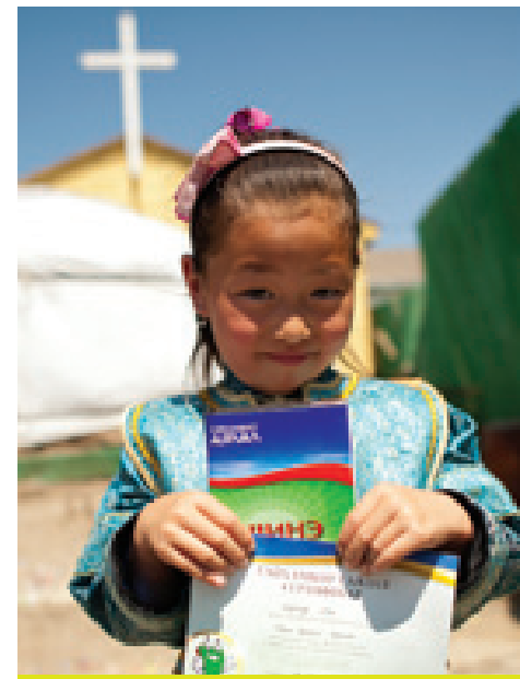
MONGOLIA: As children complete The Greatest Journey Bible study, they are proud to receive a personalized certificate as well as a New Testament.

We have translated The Greatest Journey Bible study and New Testaments into more than 30 languages. The program is now offered in over 60 countries, and more are being added each year. We have trained tens of thousands of volunteer teachers around the world to lead and guide the children as they commit their lives to Christ and learn how important it is for them to share the Good News. ■