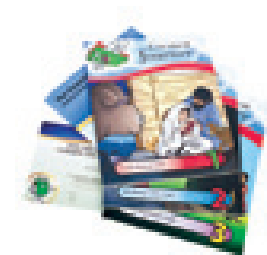
The Greatest Journey discipleship program lessons

What happens after children receive their gift-filled shoe boxes? Churches in their communities invite boys and girls to participate in Bible lessons using discipleship materials provided by Samaritan's Purse. The curriculum, called The Greatest Journey , is written in the local language and contains interactive activities with a solid Biblical foundation. Through the 12-lesson series, children learn about Jesus Christ, have the opportunity to receive Him as Savior, and are equipped to pray for and share their faith with others. Your gift will allow us to provide children with the discipleship materials along with a New Testament to help them grow in their walk with the Lord.