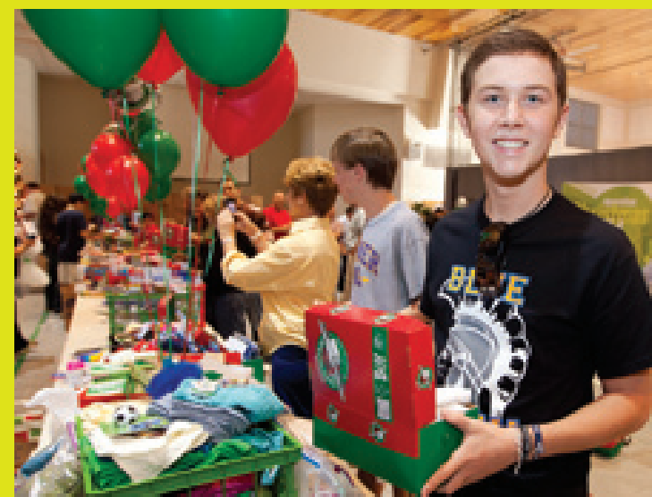
SHARING THE BLESSINGS: Scotty McCreery, the 2011 winner of American Idol, used his newfound fame to encourage fans and others to pack shoe box gifts—which he has been doing since he was a boy.