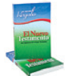
New Testaments for graduates